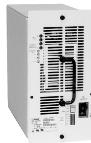
Model A100B25 100 amp Rectifier Module